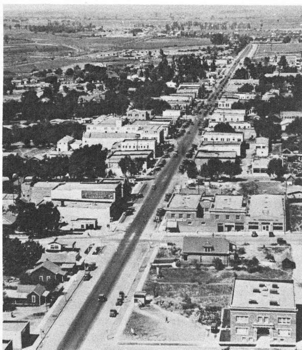
San Fernando Boulevard looking North 1920's

Published by The City of Burbank Public Information Office