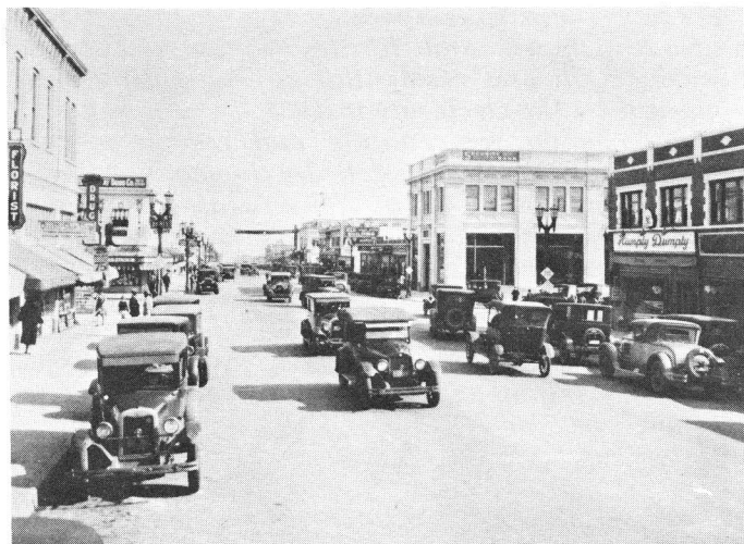
San Fernando Boulevard looking south 1927