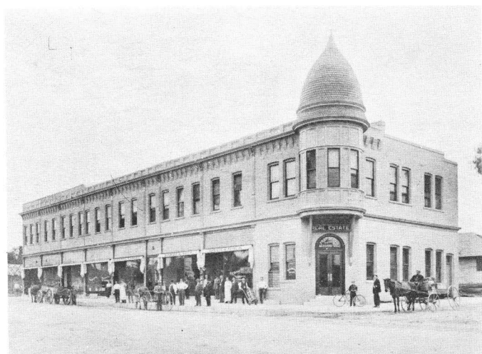
First brick block building in Burbank 1887 - still in use (Olive Avenue and Golden Mall)

The stock market crash of 1929 brought the City's boom to an abrupt halt, and the depression extended to the middle 1930's when increased employment at Lockheed Aircraft and construction work created by the Metropolitan Water District brought improvement to the economic situation.