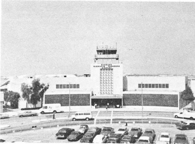
Burbank - Glendale - Pasadena Airport 1981

Emphasis on rejuvenation and redevelopment continued in the 1970's. A Redevelopment Agency was formed in 1970. The Golden State Redevelopment Project was adopted for revitalization and upgrading of the industrial area of the City. The City Centre Project was adopted to attract business to the Central Business District. A West Olive Project was adopted to encourage a media-entertainment center in the areas adjacent to Warner Bros. and NBC.