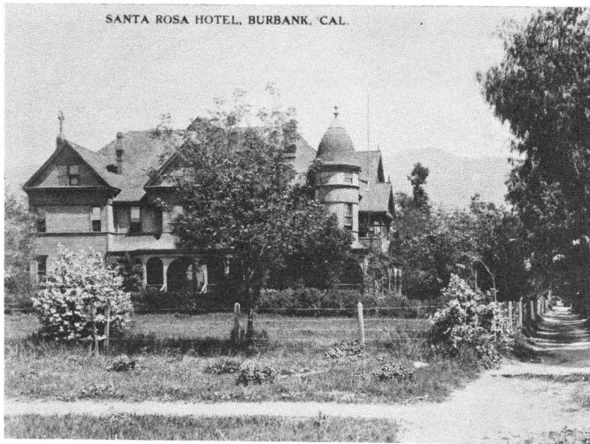
SANTA ROSA HOTEL 1887 (present site of Olive Ave. Post Office)